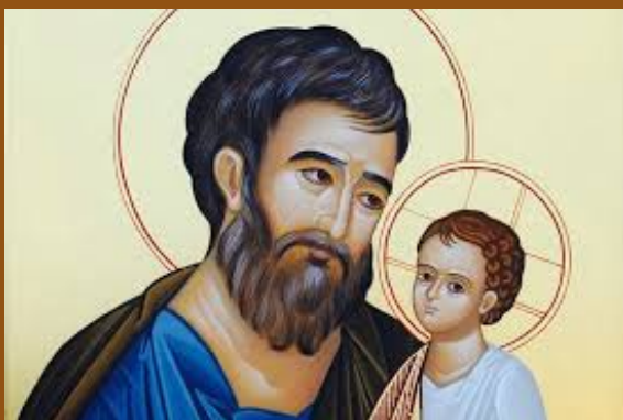
St. Joseph, Patron of the Universal Church

Know that our thoughts and prayers are with you in a special way during this Lent.